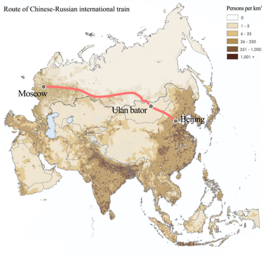
Figure 2: Route of Chinese-Russian International Train.

3. Geographical Demographic Factors: Traditional Eurasian transcontinental trains pass through sparsely populated areas, producing little economic and people-to-people effects. The new high-speed railway will connect the population core cities and promote the flow of economic factors.