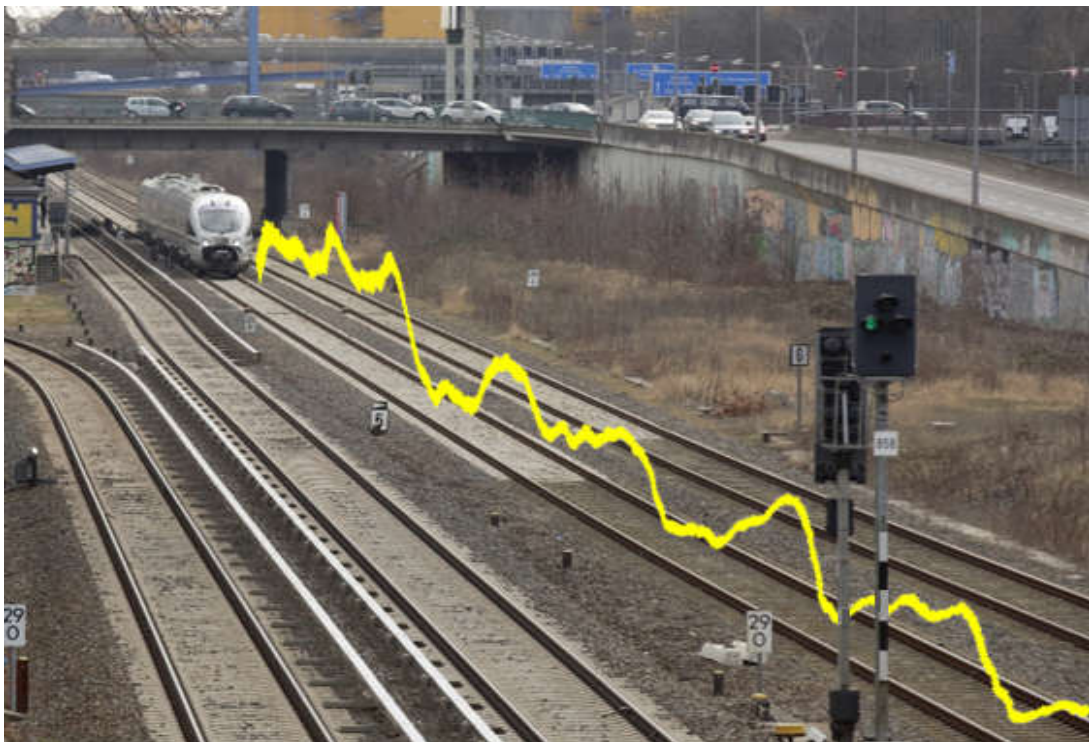
Figure 1: Illustration of magnetic signatures along a railway track.

A key technological enabler for this enhancement is safe and robust self-localization of trains. The localization must be available in all the different railway environments and must provide a high accuracy and reliability. A single sensor may not achieve the required high safety and integrity levels, but a suitable combination of different sensor types can largely improve availability and as errors are mostly independent for different measurement principles, such a combination also allows identifying positioning errors of single sensors. GNSS for example will not be available in tunnels. On the other hand, distance measurements from odometry or inertial sensors lead to growing position uncertainty. As an advantageous complement we have developed an alternative localization method based on magnetic field measurements [2], which even works in GNSS-denied areas. Ferromagnetic material along the railway lines like rails, masts, catenaries or reinforcement steel cause position-dependent, mostly time-invariant variations of the earth magnetic field, which can be exploited for positioning. The so-called magnetic signatures allow for absolute location determination in the order of meters [3] and can specifically be used to identify the used track on multitrack lines [4].