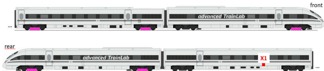
Figure 3: Measurement setup with sensor X1 of type Xsens MTi-610 on the floor inside the train on the centerline, and magnetic track brake positions (purple).

the same direction on the same track with a separation time of at least one hour each, all the MTBs of the train were activated during the second run. It was completely open, whether their activation would be visible in the measurements at all, or if the signatures would be different after activation for a short time or even permanently.