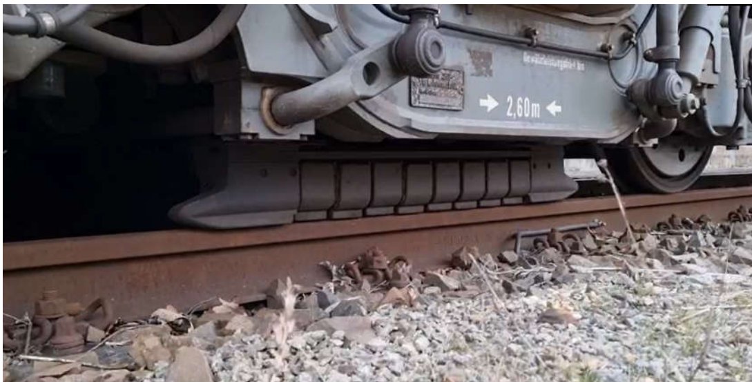
Figure 4: Lowered MTB at standstill.

The MTBs on the ICE consist of pole shoes with coils and a suspension. When current through the coils is activated, a magnetic clamping force pulls the pole shoes against the rail head and generates friction which is not limited by wheel-rail contact and is therefore advantageous in slippery conditions. Since MTBs usually act unregulated and at their maximum brake force, they are primarily used as safety and emergency brakes. To avoid excessive jerk, they are automatically deactivated during the final braking phase well before standstill.