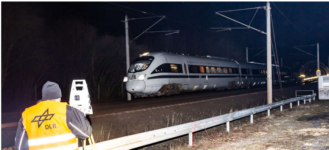
Figure 2: Tracking the train's position with a laser tachymeter to obtain a position reference in tunnel sections and other GNSS degraded areas.

For the measurements in the project IMPACT (Intelligent Magnetic Positioning for Avoiding Collisions of Trains) the advanced TrainLab ICE from Deutsche Bahn has been equipped with more than 40 magnetometers at various positions inside and underneath the train. For position reference, data from several GNSS (Global Navigation Satellite System) receivers, IMUs (Inertial Measurement Units) and odometry has been recorded. In addition, laser tachymeters operated at specific trackside locations were tracking the position of several prisms installed on the passing train. In this way, precise trajectories of the moving train with up to centimeter level accuracy could be determined in postprocessing even in tunnel sections where GNSS reception was degraded or not available at all.